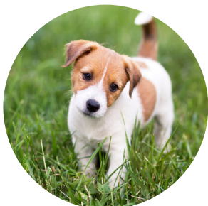
MOVING YOUR PET TO IRELAND