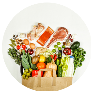
COST OF LIVING IN IRELAND