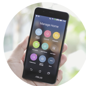
SETTING UP UTILITIES