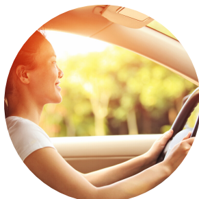
DRIVING IN IRELAND